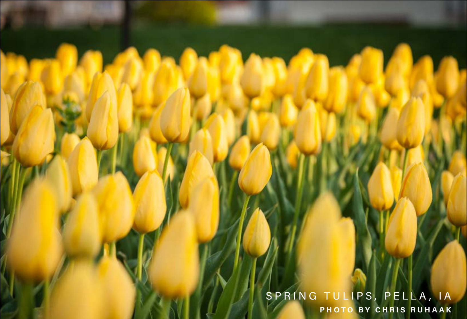
SPRING TULIPS, PELLA, IA