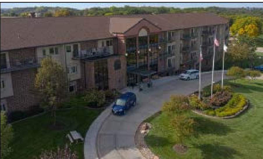
COVER IMAGE, VINCENT BLUFF, COUNCIL BLUFFS, IA