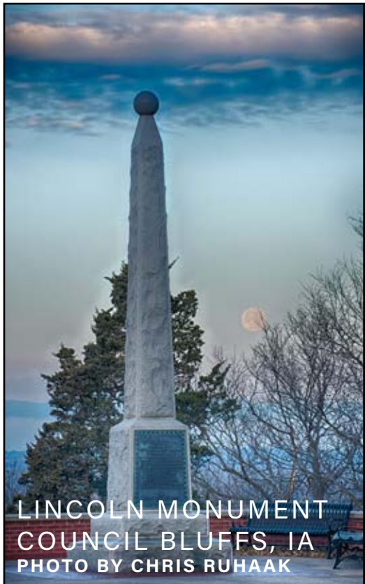
LINCOLN MONUMENT COUNCIL BLUFFS, IA

3000 Risen Son Blvd, Council Bluffs, IA 51503 Office: 712.325.7040 www.christianhorizons.org